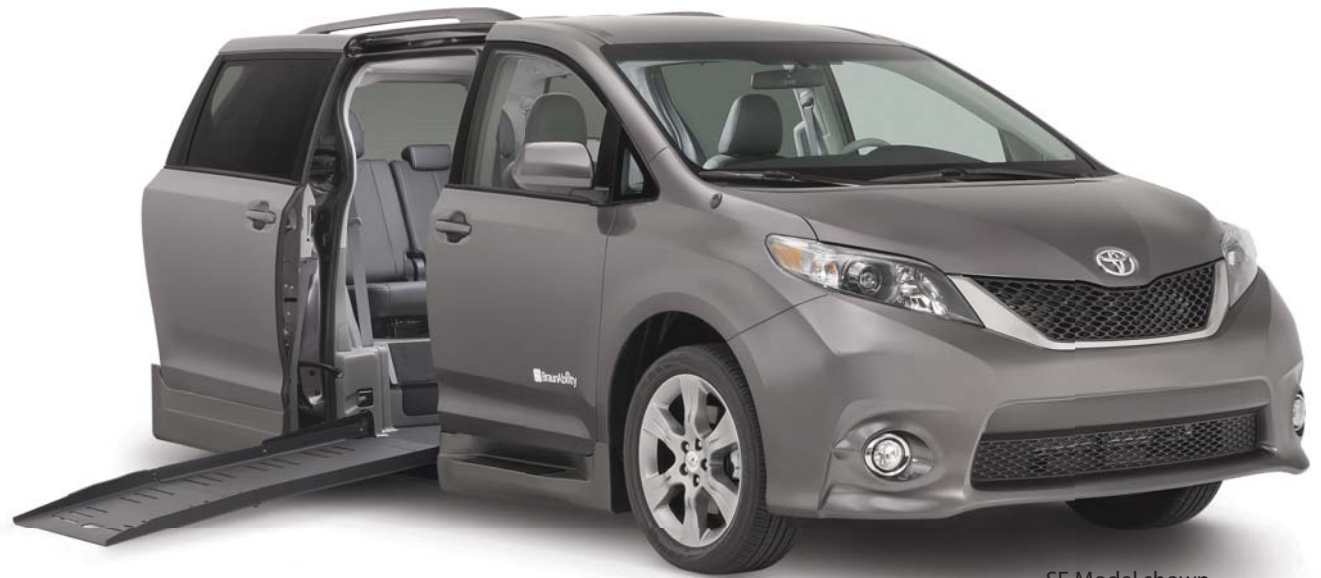
SE Model shown